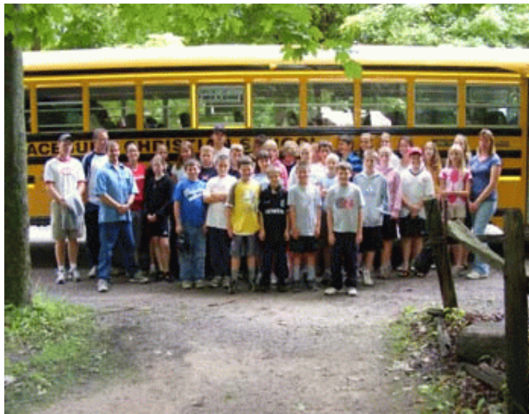
Grade 5-8 Fair Glen Trip