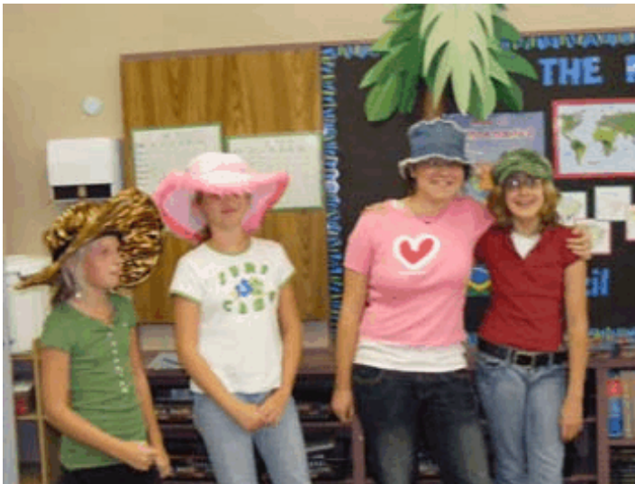
Hat and Gum Day: An A-TEAM Fundraiser for sponsorship of a Christian school in the Dominican Republic