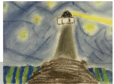
Starry Skies by Derek

Art - In art we have been learning about artistic techniques such as pointillism, colour schemes, and different methods of making stars in a night sky.