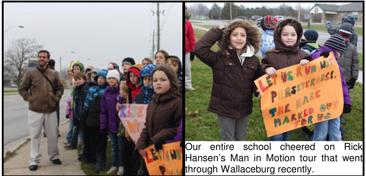
Our entire school cheered on Rick Hansen's Man in Motion tour that went through Wallaceburg recently.