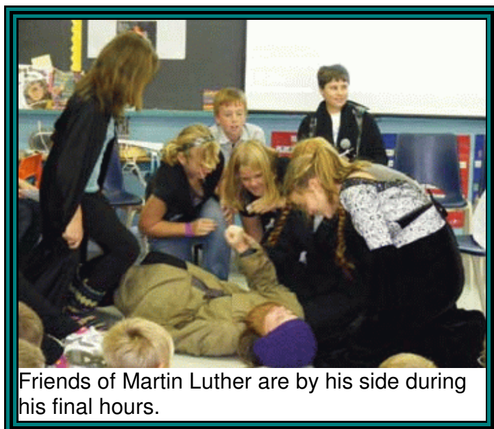
Friends of Martin Luther are by his side during his final hours.